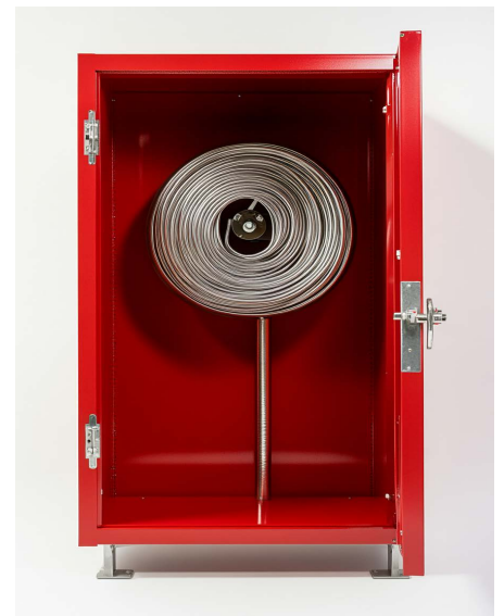
Hose Reel Cabinet