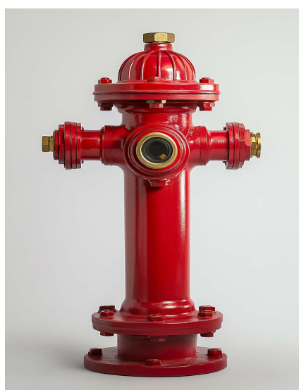
Above-Ground Hydrant — Dual Outlet