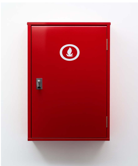
Indoor Fire Hose Cabinet